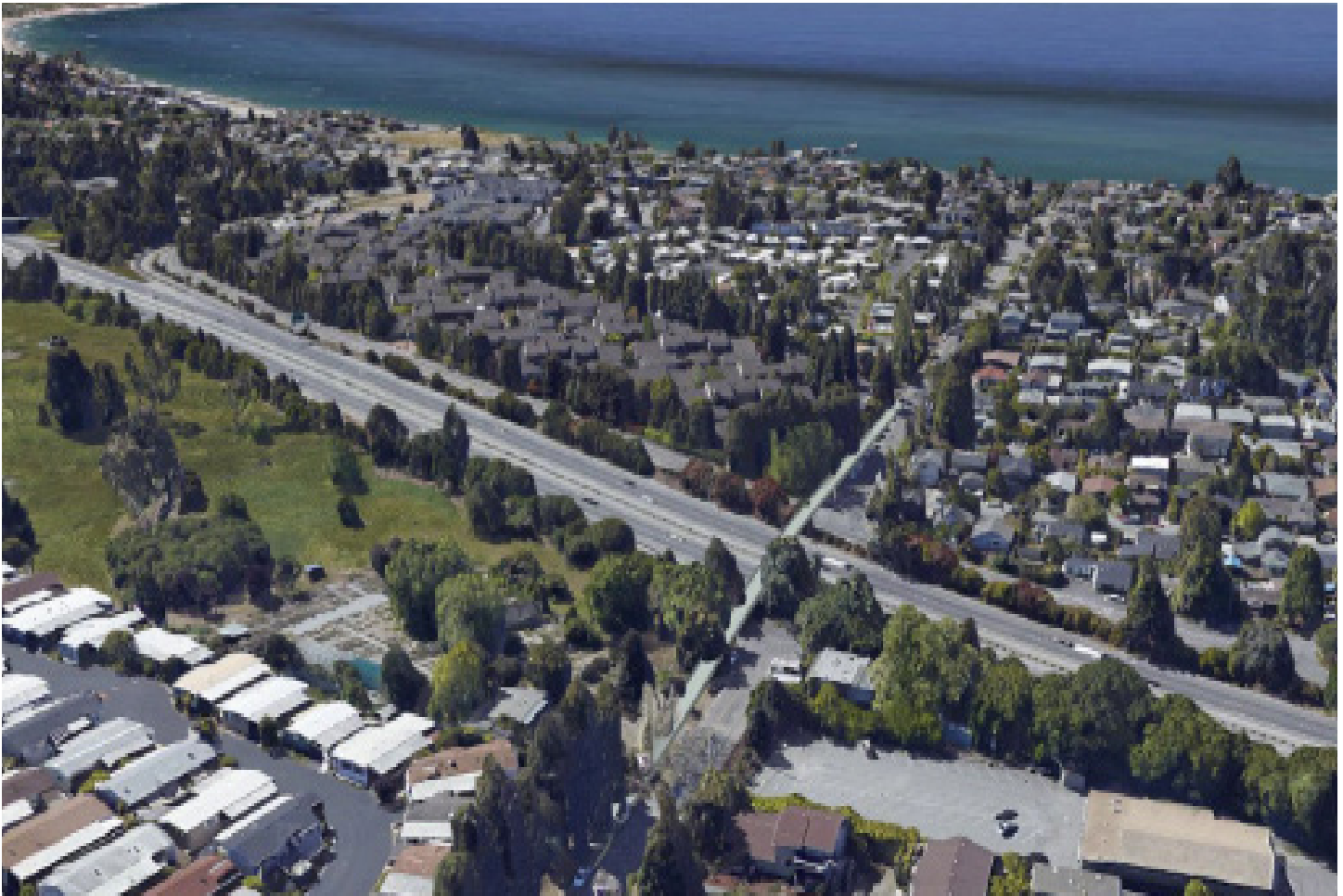
Project Area with proposed overcrossing shown