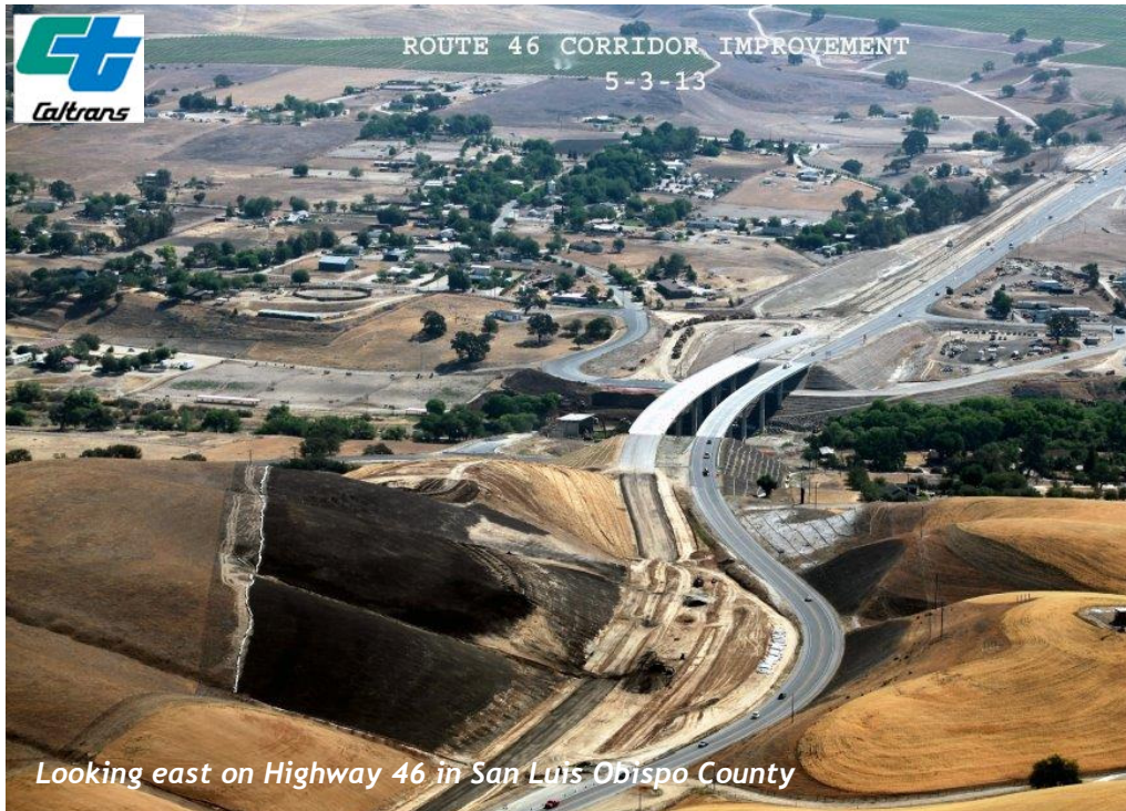
Looking east on Highway 46 in San Luis Obispo County