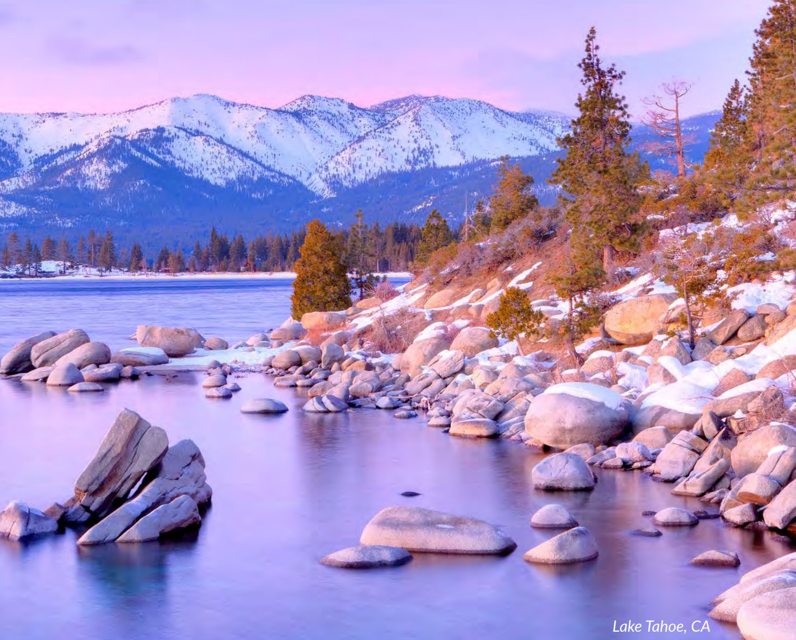
Lake Tahoe, CA