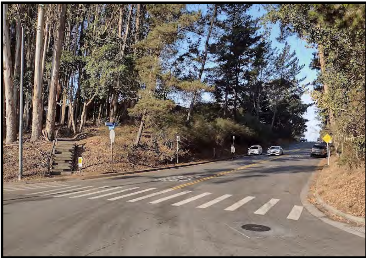
Kennedy Drive Looking West

Project Description: The City of Capitola Kennedy Drive Sidewalk Project has been designed to fill in a gap in the City's existing pedestrian facilities. Primarily a pedestrian safety project, this project proposes the new construction of approximately 550 feet of new sidewalk along Kennedy Drive from Sir Francis Avenue to Park Avenue. This section of roadway is a primary pedestrian access road from the Cliffwood Heights neighborhood to New Brighton State Beach and McGregor Park. Current conditions have parking along the curb line, forcing pedestrians to walk next to traffic. The addition of a sidewalk will eliminate conflicts between pedestrians and vehicles and bicycles. Project elements include new sidewalk, curb and gutter, retaining walls, and ADA curb ramps. Project design efforts will include analysis of the removal of parking on the north side of street to accommodate an uphill bike lane. This project was identified during the public scoping sessions for McGregor Park, a multi-use park located approximately 1/4 mile east of the intersection of Kennedy Drive and Park Avenue. The construction of McGregor Park increased pedestrian traffic along this corridor with few other options available.