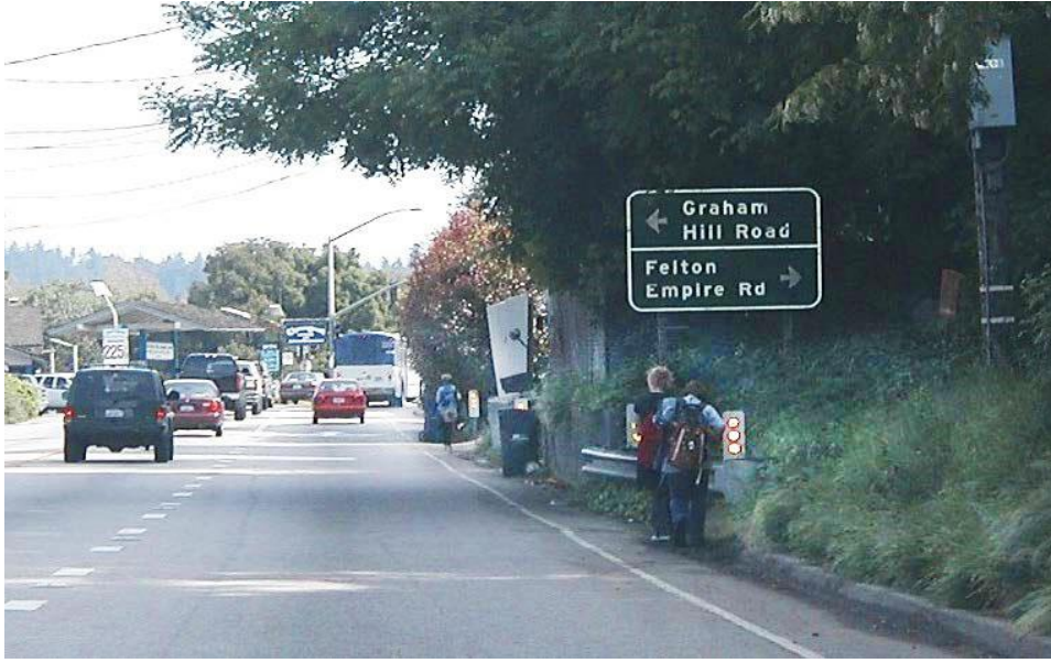
Students walking south from schools to Graham Hill Rd in narrow nonstandard shoulder