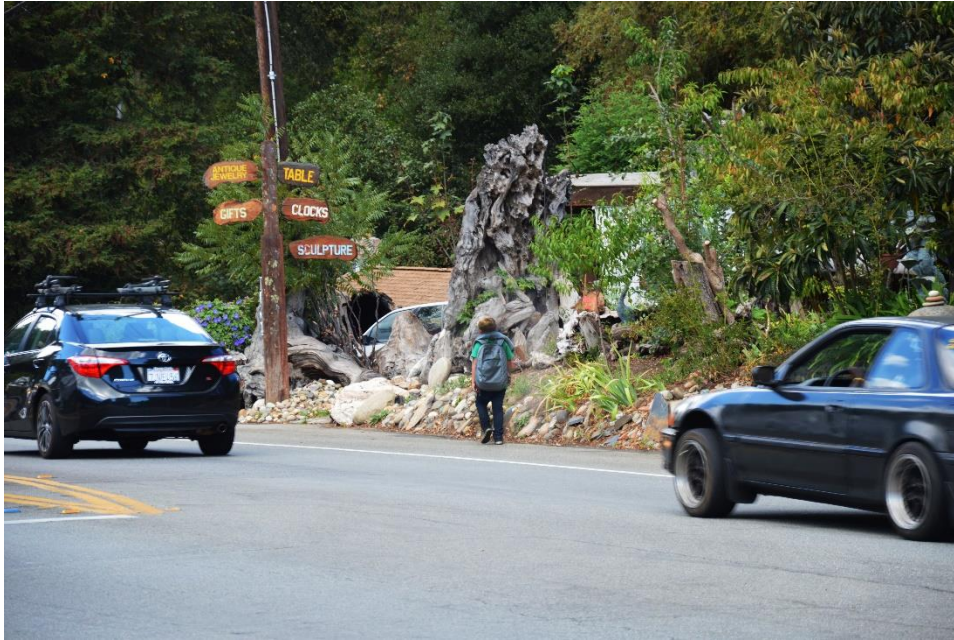
Students walking north from schools to Glen Arbor Rd in narrow nonstandard shoulder