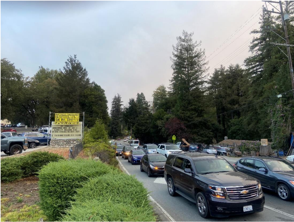
Southbound morning drop-off congestion at High School entrance