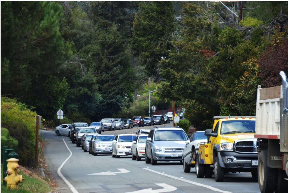
Congestion between Elementary and High School entrances during afternoon pick up