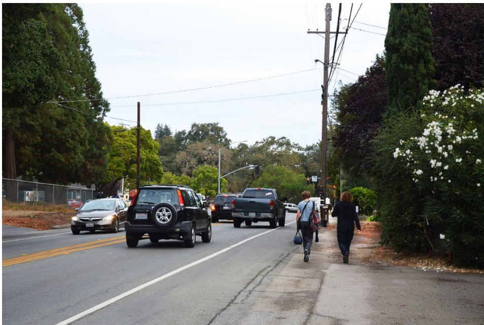
Students walking north from Graham Hill Rd to schools in shoulder