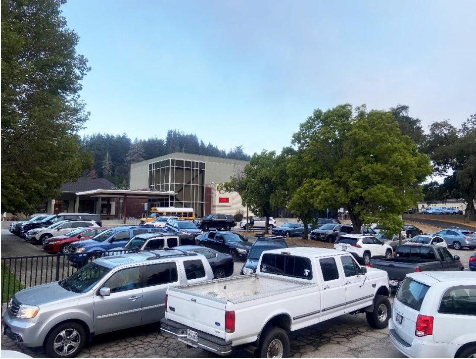
Congested internal drop-off circulation at High School