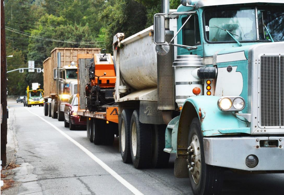
Goods movement idling in congestion at SLV Schools Complex northbound