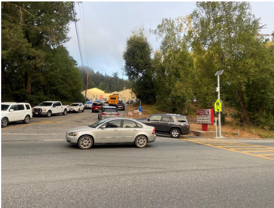
Southbound morning drop-off congestion at Elementary School entrance