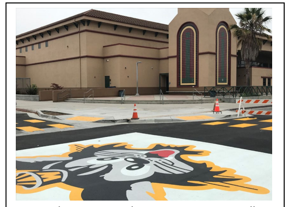
Lincoln Street Overlay Project – Watsonville