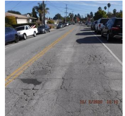
Santa Cruz Overlay Project – Fairmont Avenue, before & after