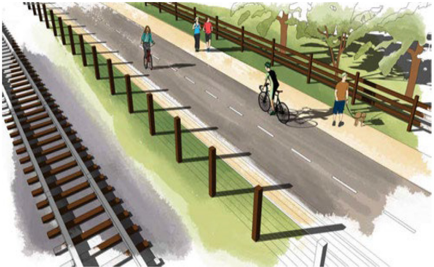
Preliminary project rendering

*Includes TDA, ATP, and Land Trust funds.