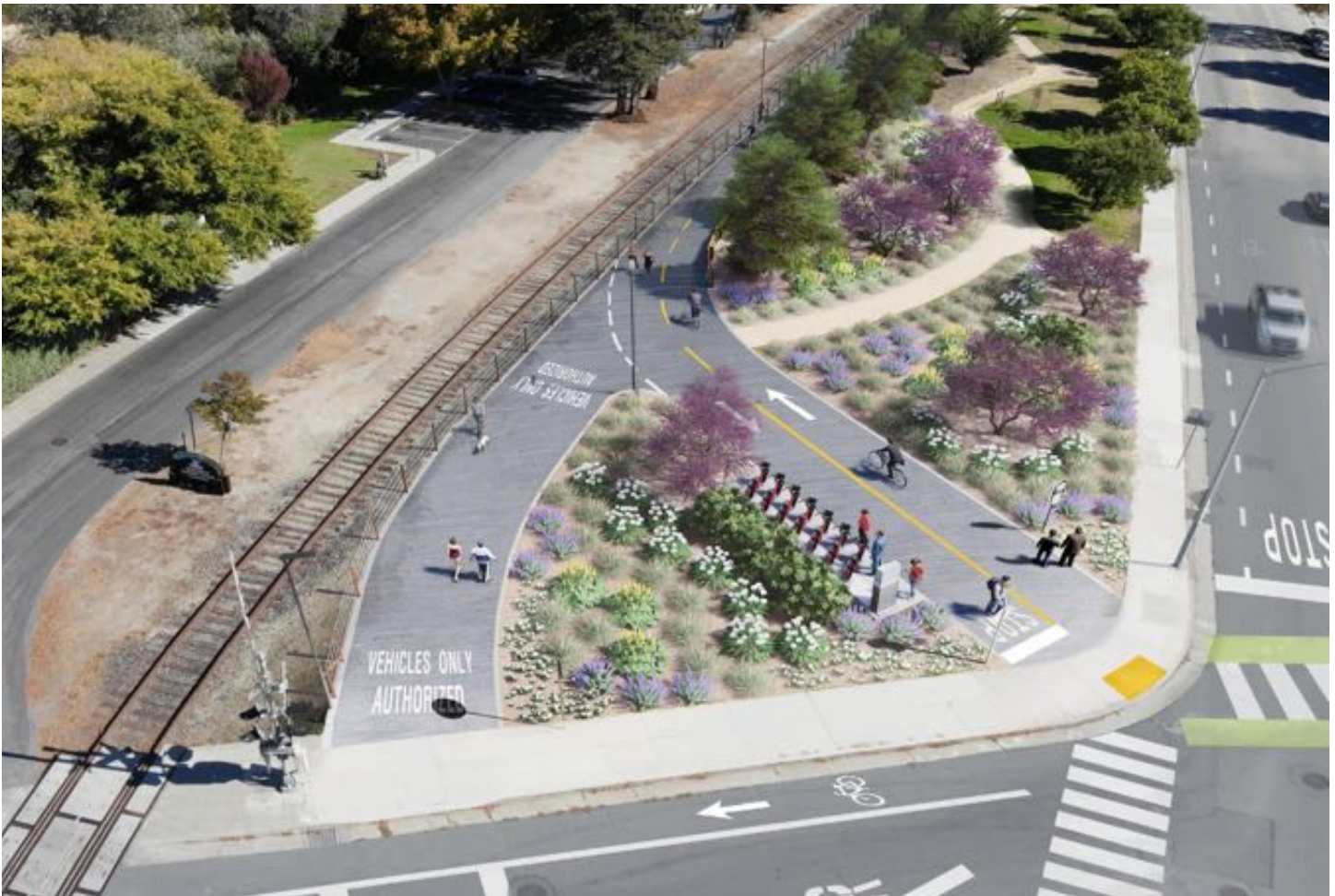
Preliminary Project Rendering

Construction of Phase 1 was completed in December 2020 and the trail is now open. Phase 2 is environmentally cleared and design is complete. Phase 2 is scheduled to go to construction in spring 2022.