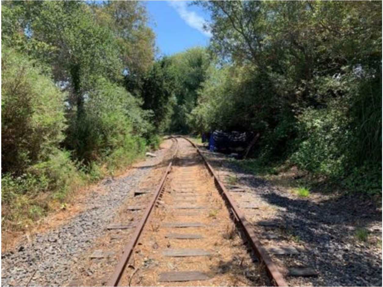
Figure 1: Before Project