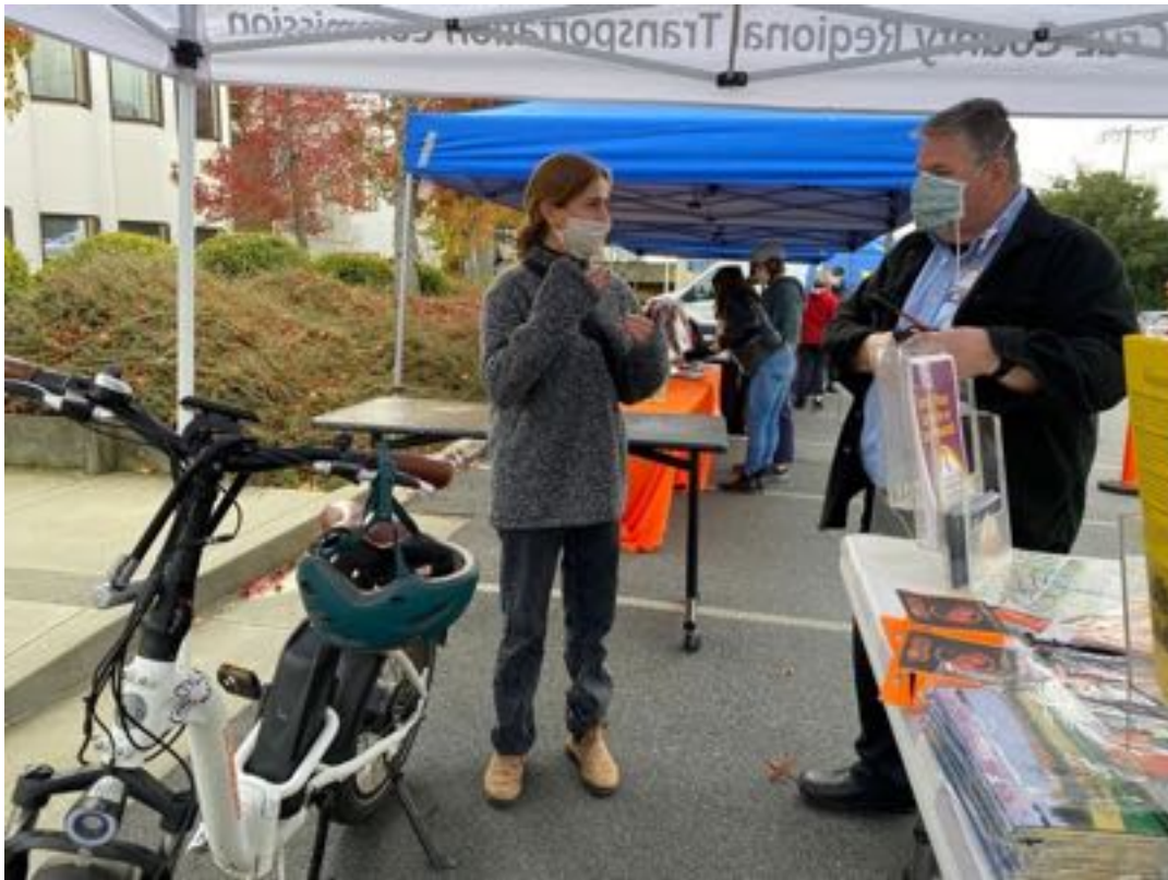
Figure 1 – December 2021 GO Santa Cruz County tabling at Dominican Hospital Sustainable Transportation Fair