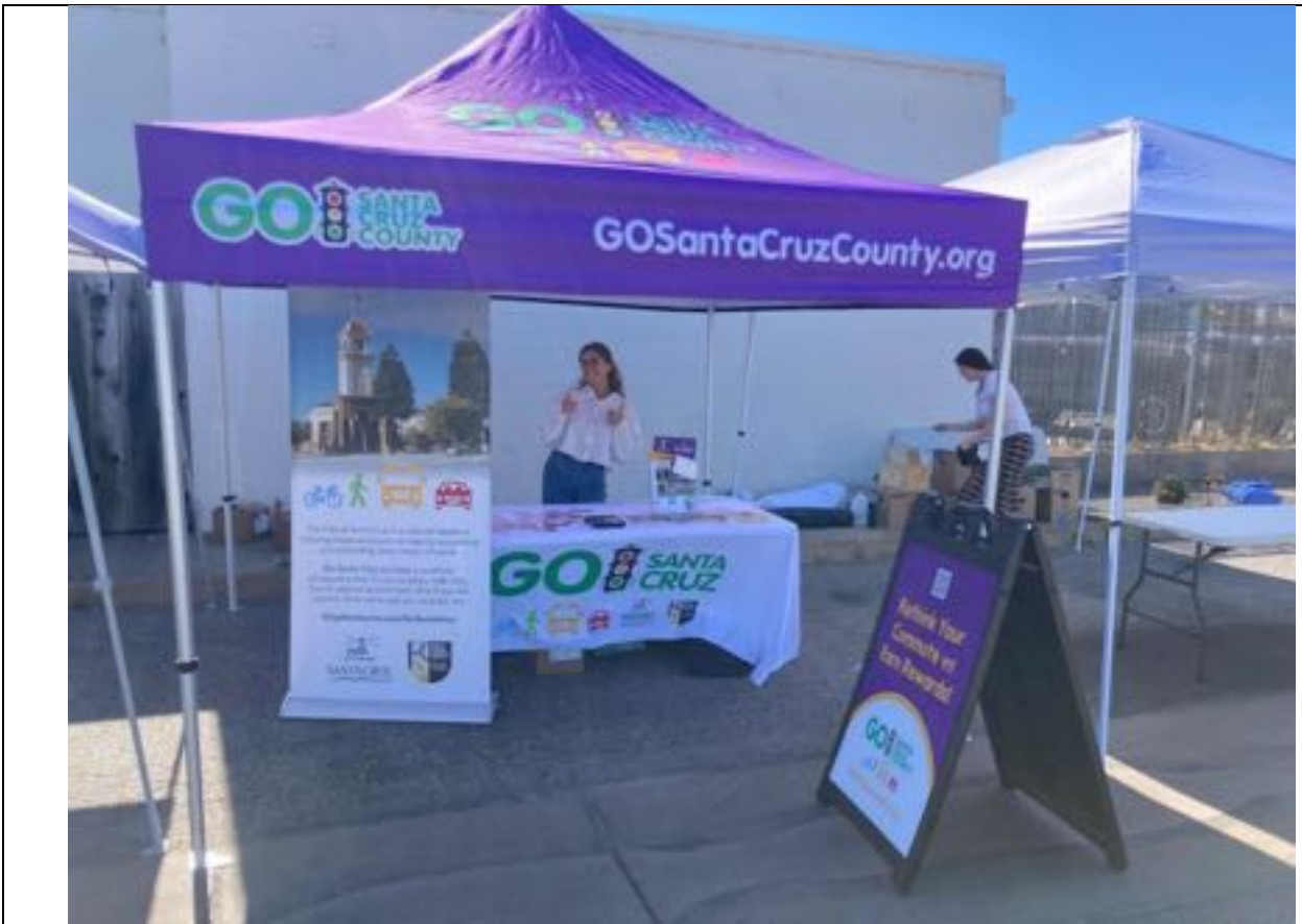
Figure 2 - September/October 2021 GO Santa Cruz County tabling at Midtown Fridays! Summer Block Party