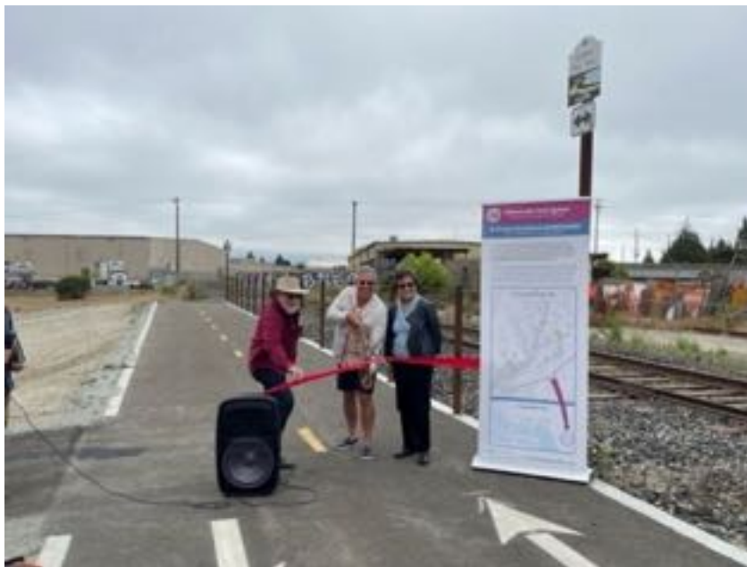
Segment 18-Phase 1 Ribbon Cutting