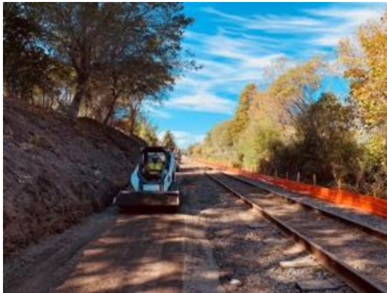
Segment 7-Phase 2 Rail Trail Construction in Santa Cruz