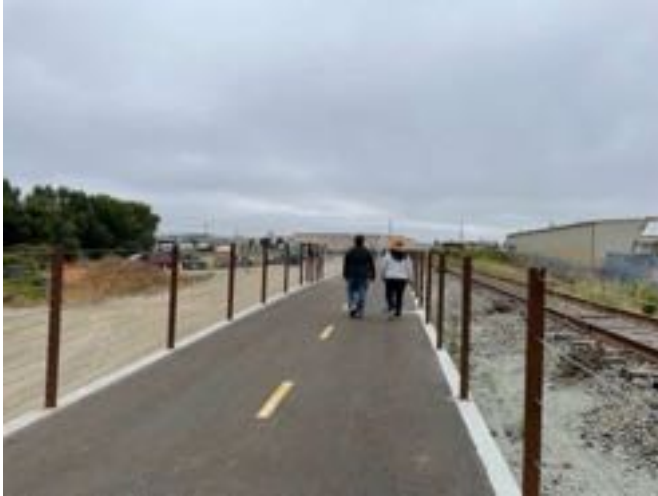
Segment 18-Phase 1 Rail Trail

15. Fact Sheets on larger projects: Attached