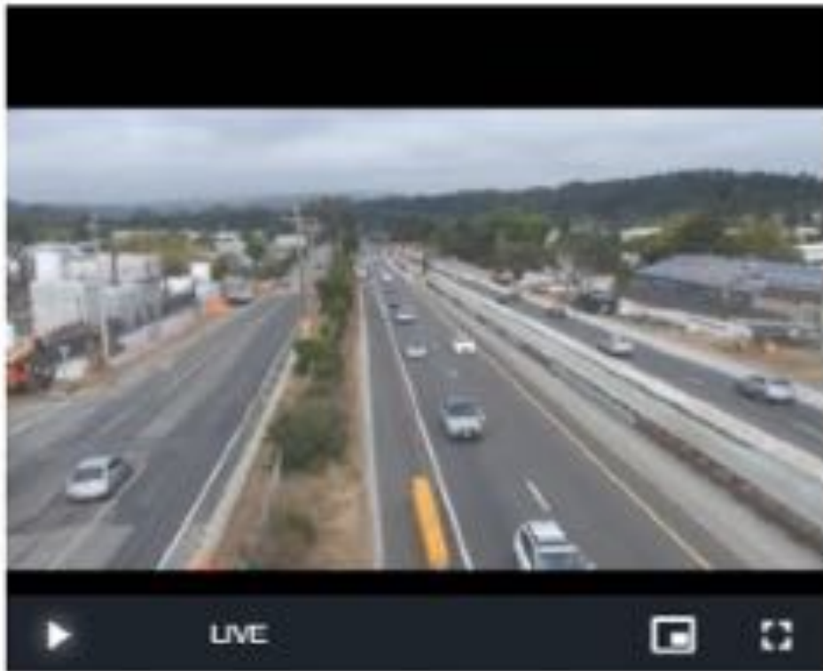
SR-1 : Santa Cruz SR-1: Chanticleer Ave Ped OC

Weather Forecast as of 08:26:00 PDT on 2023-09-26 : High: 75°F Today : Becoming Sunny Low: 55°F Tonight : Partly Cloudy Sunrise: 07:00 PDT Elevation : 42 feet Sunset: 18:57 PDT