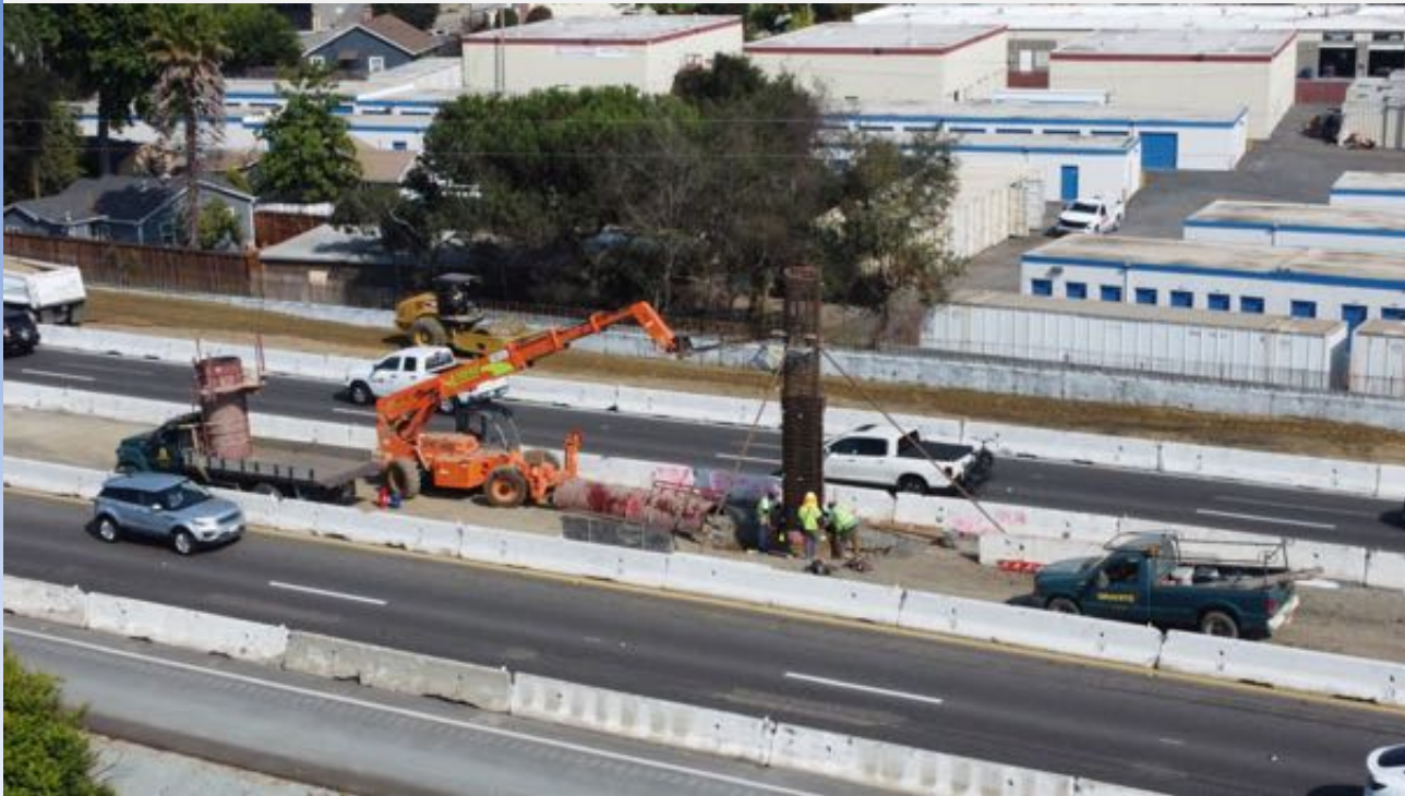
Median Bent 5