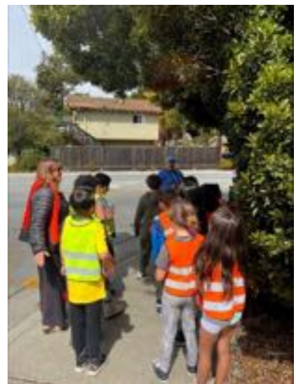
Green Acres Elementary, May 2023