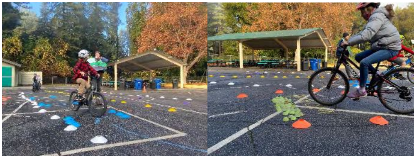
Boulder Creek Elementary, December 2022