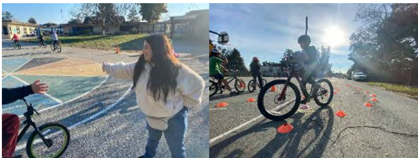
Santa Cruz Gardens Elementary, December 2022