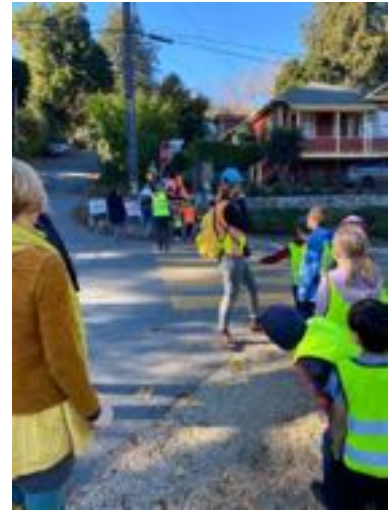
Boulder Creek, November 2022