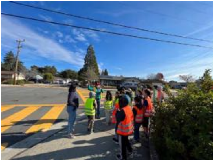
Santa Cruz Gardens Elementary, December 2022