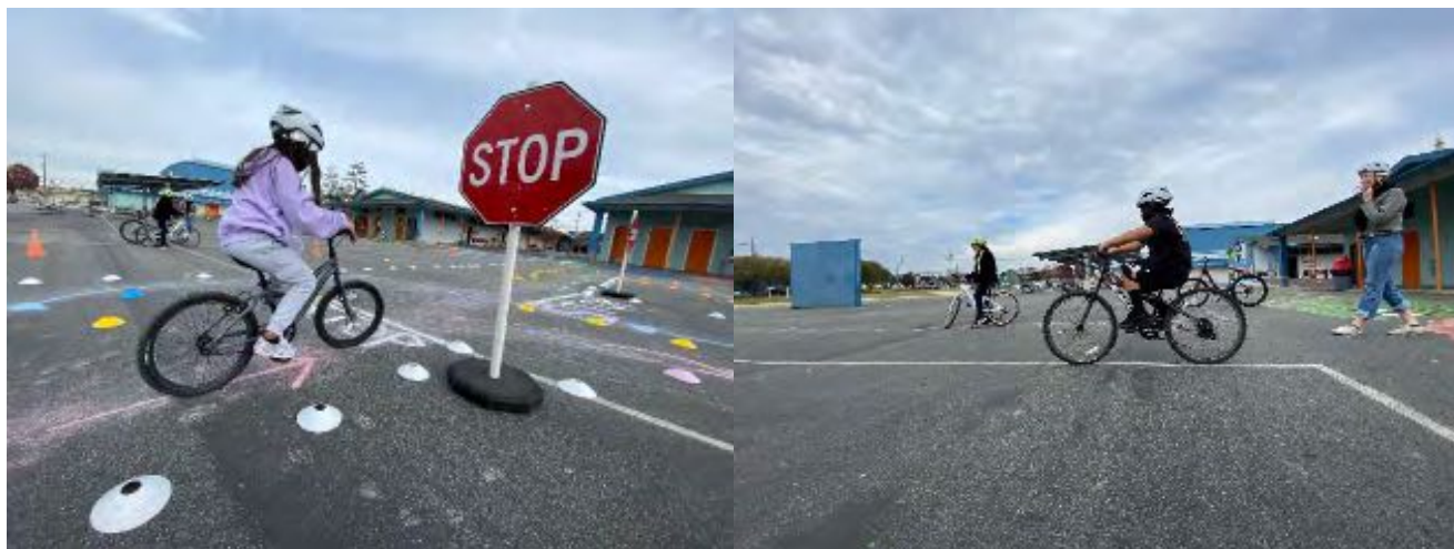
Live Oak Elementary, December 2022