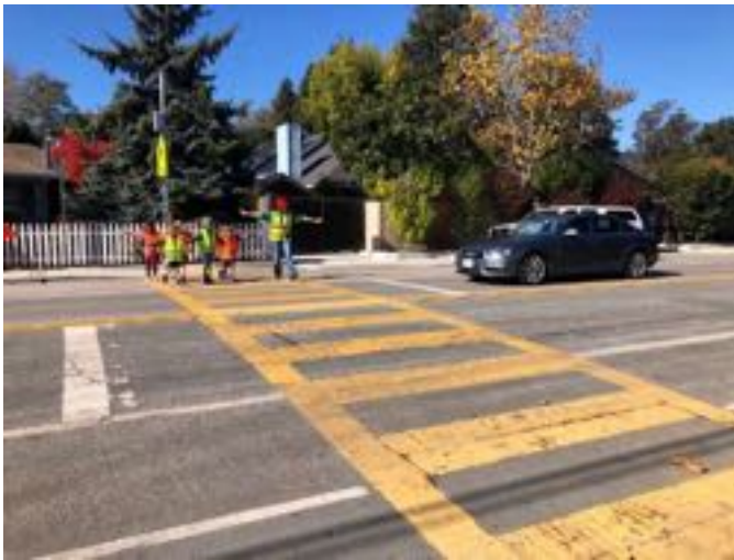
Main Street Elementary, November 2022