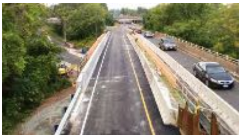
Roadwork in Connecticut. The National Highway Construction Cost Index continued to increase in the first quarter of 2023, though at a slower rate than in 2021 and 2022.

Construction costs affect the amount governments invest in new roads, highways and bridges, particularly in using the outflow of federal funds from the bipartisan infrastructure law of 2021 , which provides $350 billion from fiscal years 2022 through 2026 to states and other municipalities for highway and bridge construction projects.