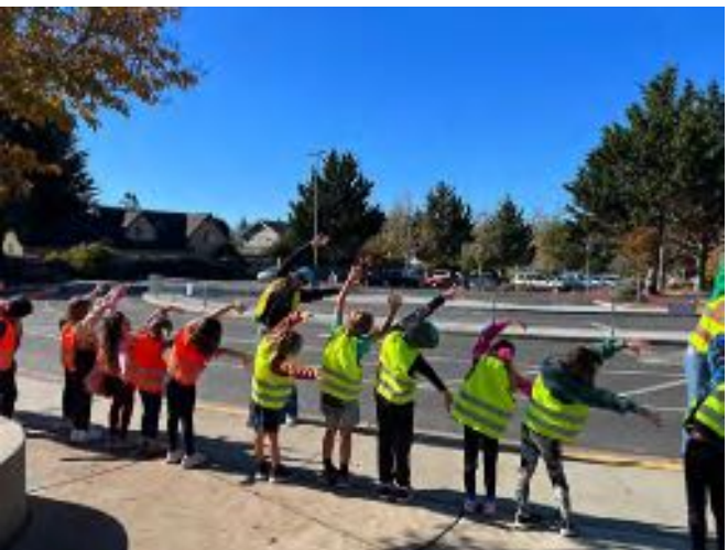
Main Street Elementary, November 2022