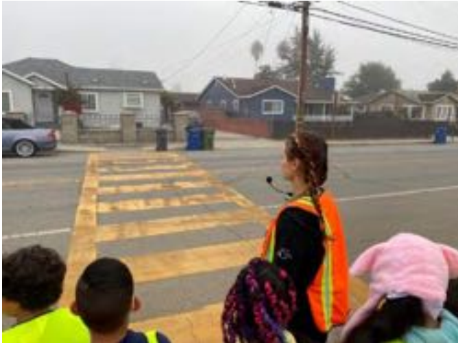
Amesti Elementary, October 2022