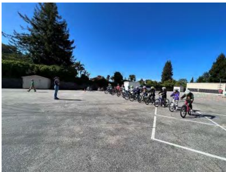
Main Street Elementary, April 2023