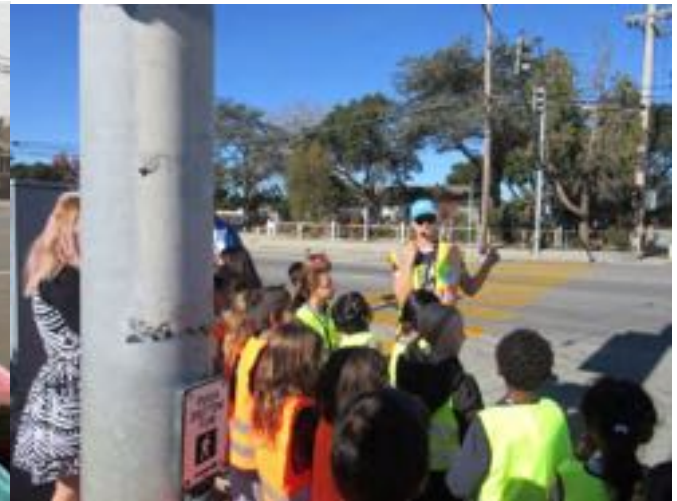
Live Oak Elementary, November 2022