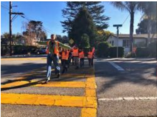
Live Oak Elementary, November 2022