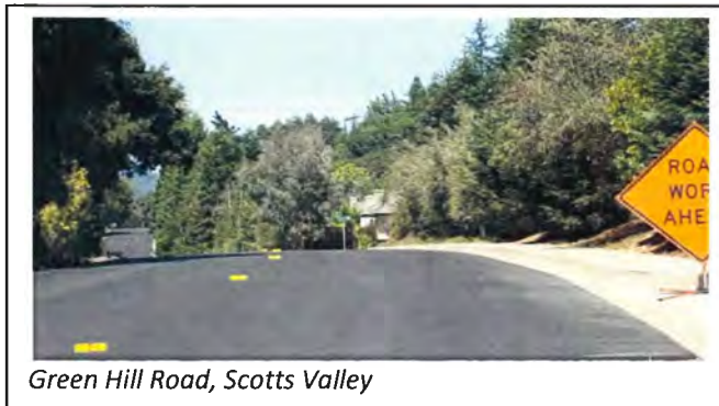
Green Hill Road, Scotts Valley