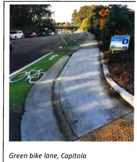
Green bike lane, Capitola