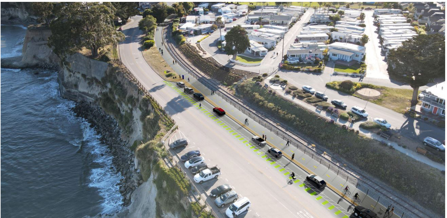
Preliminary project rendering

The project's environmental phase began in 2021, and was completed in Spring 2024. The final design phase is expected to be completed in 2025. The project is scheduled to go to construction in 2026.