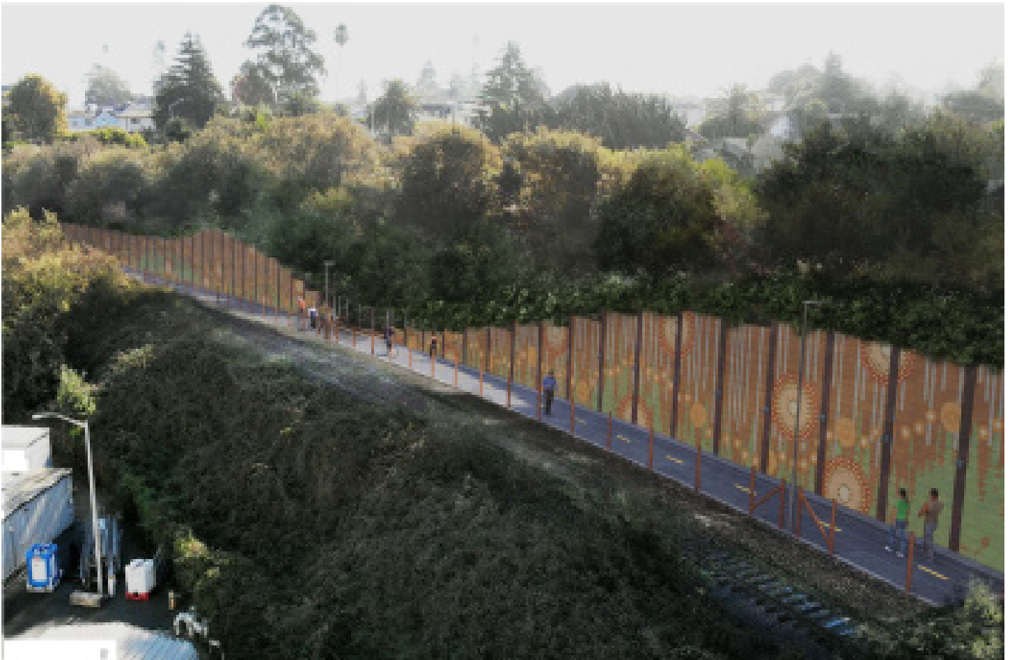
Project Rendering: Segment 7, Phase II

Construction of Phase 1 was completed in December 2020 and the trail is now open. Construction of Phase 2 began in July 2022 and is scheduled to be completed in Winter 2023.